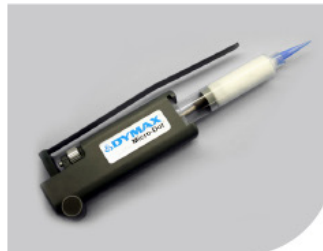
Lever Actuated Micro-Dot Syringe Dispenser (T20010)

The Micro-Dot™ portable syringe dispenser offers positive-displacement accuracy for dispense volumes as small as 0.0003 mL. Once a volume is set it can be repeated with accuracy. This syringe dispenser utilizes a pre-packaged disposable syringe as its fluid reservoir, preventing any contact between the fluids and the dispenser eliminating fluid contamination during dispense. With the proper dispense tip selection, the Micro-Dot is suitable for dispensing a wide range of low-to-high viscosity fluids including pastes, lubricants, adhesives, sealants, and more.