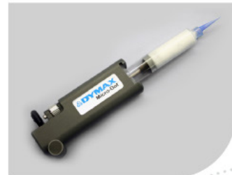
Thumb Actuated Micro-Dot Syringe Dispenser (T20000)

Contact the professionals at Fiber Optic Center for a quote or to get more details.