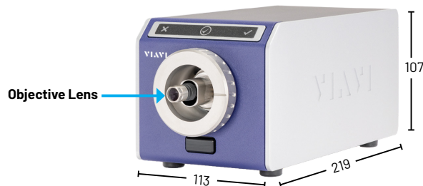
3 FVAM-2000 Benchtop Fiber-Connector Microscope

The FVAM-2000 combines high-resolution imaging and advanced features, all within a space-saving form. This innovative approach redefines benchtop microscopy, delivering all the functionality in a small footprint.