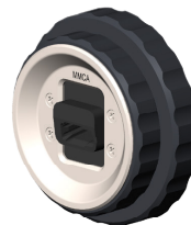
FMAX-MMCA: Inspection Adaptor for MMC

Dedicated FMAX series adapters enable inspection with the FVAi series.