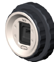
FMAX-TMTA: Inspection Adaptor for TMT Ferrule

Contact the professionals at Fiber Optic Center for a quote or to get more details.