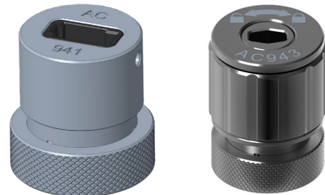
AC941: Patchcord testing MMC Adaptor

AC Detector Adaptors enable testing with the MAP series Optical Power Meters, Insertion Loss/Return Loss Meters and Swept Wavelength system.