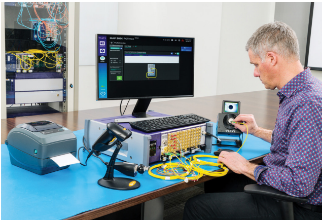
MAP-380 with PCT Test System

The PCT Test Solution consists of a powerful family of modules, software and peripherals for testing IL, RL, physical length, and polarity.