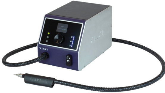
CleanBlastPRO end face cleaning system

The CleanBlastPRO is an automated cleaning system that ensures clean fiber end faces with reliable, repeatable and fast results at the push of a button.